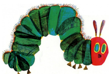
'A Very Hungry Caterpillar' in Willow Class