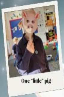
One "little" pig