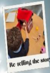
Re-telling the story