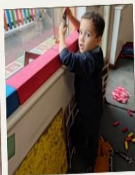
Building with "big" bricks