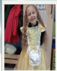
Our very own Goldilocks