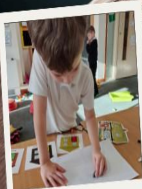
Designing our own houses.

We have enjoyed role play and getting into character.