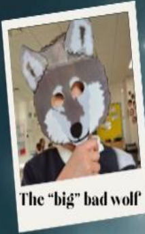
The "big" bad wolf