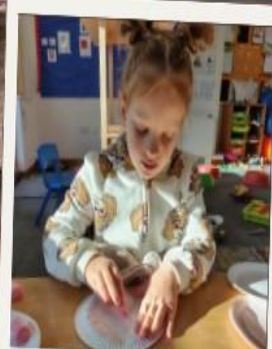
"Little pig" chalk faces.