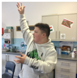
13 B did 6 Bollywood Dances!