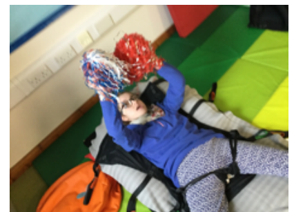
CEDAR Class did 60 minutes of physio!