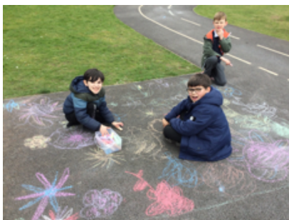
Rowan class drew 60 flowers