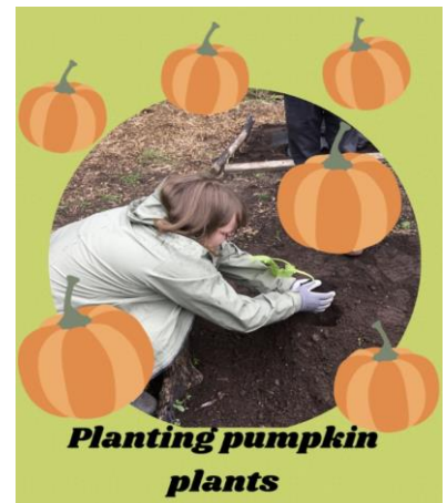
Planting pumpkin plants

Students have been busy harvesting pumpkins we have grown at the allotment. We will be raffling off the pumpkins to staff for 50p a ticket to help raise money to buy more seeds and products to use at the allotment.