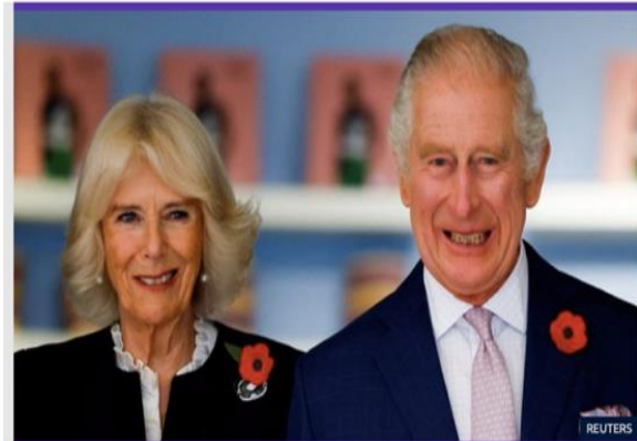
King Charles (R) and his wife Camilla, the Queen Consort (L) both have their own Royal monograms