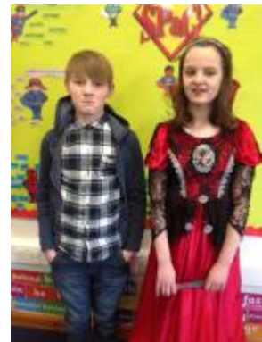
YEW CLASS Trip to the Library on World Book Day