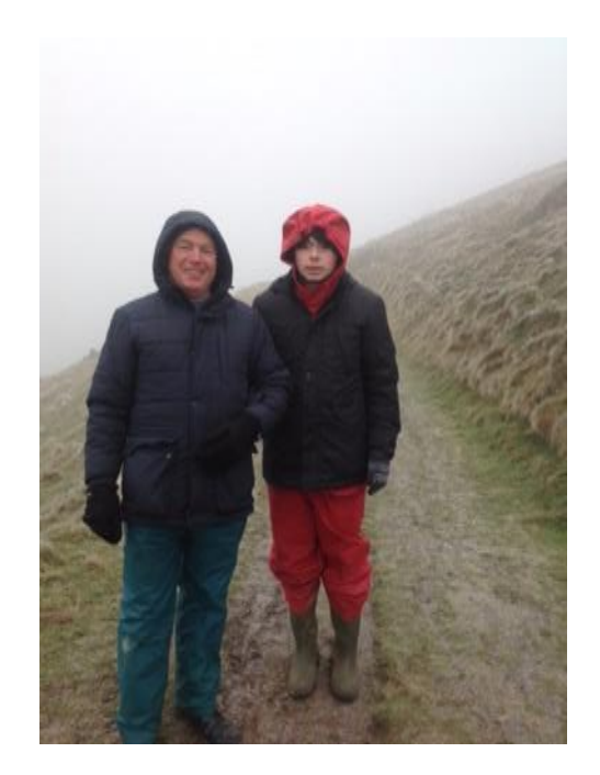
"Bbbbbrrrrr - it's chilly on the top of The Malvern Hills"