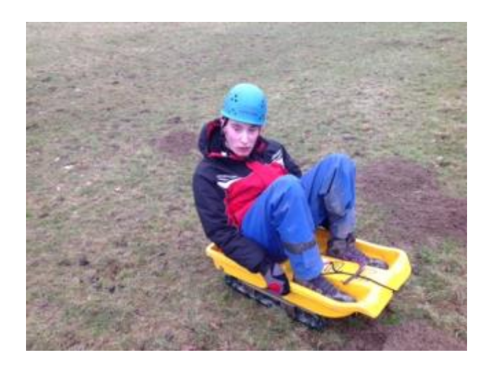
"This grass sledging lark is great fun - am I expected to get out, stand up and drag it back to the top of the hill?"