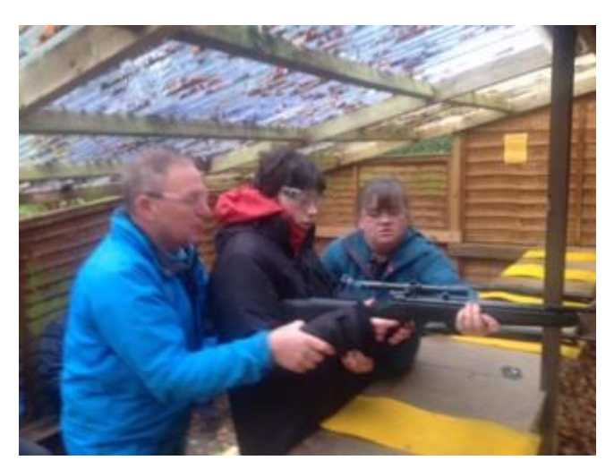
"Stick Em Up! - I'm armed and dangerous!"