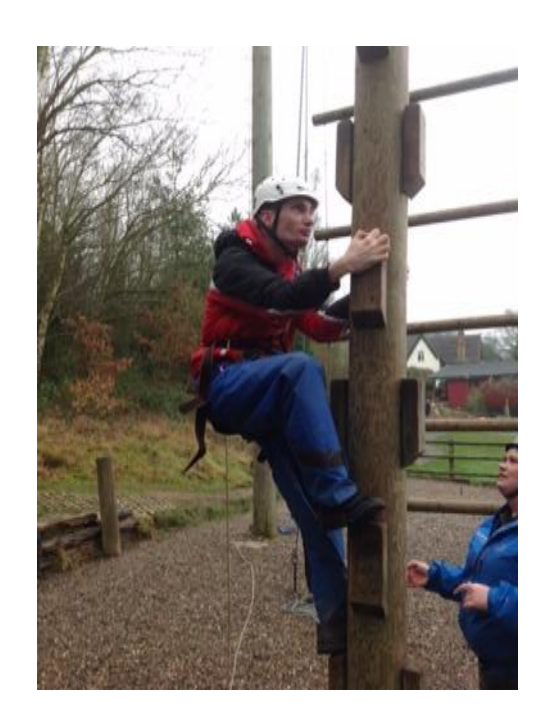
"Going up - can I get a job for BT? I quite like this climbing lark!"